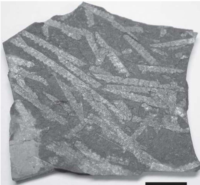
Fig. 1 - Lower Graptolitic Shales, Goni Section, level with M. praedeubeli (Wenlock, identified by H. Jaeger, 1987, pers. com.). Scale bar = 1 cm (refigured after Corradini et al., 2002).