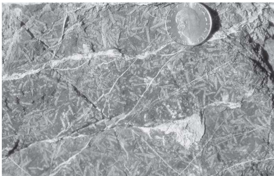
Fig. 3 - Graptolitic limestone exposed in southwestern Sardinia (Perd'e Fogu locality, Fluminimaggiore area). Coin for scale = 24 mm.

A crinoidal bioclastic packstone, associated with Scyphocrinites loboliths, caps the Fluminimaggiore Fm. The same distinctive horizon is present in many other Gondwana