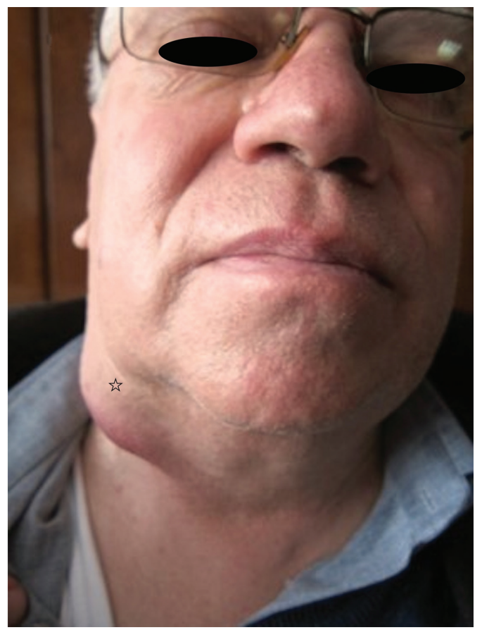
Figure 3. Tularemia

Actinomycosis is a chronic, suppurative, granulomatous disease mainly caused by Actinomyces israelii . A. israelii is a Gram-positive, non-acid-fast, anaerobic, or microaerophilic, filamentous branching bacterium. It is found in the normal flora of the oral cavity. It is generally harmless. However, it can be dangerous in the presence of mucosal damage and the presence of another pathogen<sup>1,4,12</sup>. Actinomycosis mainly includes cervicofacial, thoracic, abdominal, and pelvic forms. The cervicofacial form is the most common. The infection is seen after trauma, especially after tooth extraction, as a submandibular or supramandibular nodule or swelling. The skin is purple and warm with palpation. Subsequent