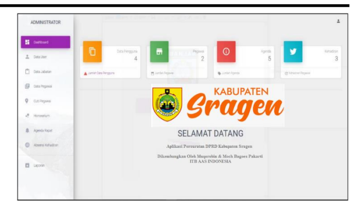
Figure 2. ITB AAS Indonesia Lettering Application Design

The implementation of the Correspondence Project that has been developed using a combination of PHP and Native and Codeigniter Framework can be seen in Figure 2.