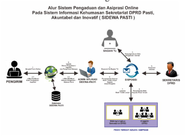
Figure 1. Sragen Regency DPRD Application Letter System Flow

The results of testing the two applications by testing the hardware and software system can be explained that the making of a letter information system application at the DPRD Secretariat of Sragen Regency with a framework codeigniter is better than using PHP Native. This is evidenced by the system testing carried out, the results show that the CodeIgniter Framework is superior or better than PHP Native. This is proven that in the development of a system in terms of existing performance ranging from Response Time, Throughput to Requests Per Second, CodeIgniter Superior and for other things such as Databases are the same because they use the same Database and CRUD implementation is also the same, only PHP Native is slightly superior in slightly more concise code but over all tested systems the CodeIgniter Framework is superior. The System Process Flow can be seen in Figure 1.