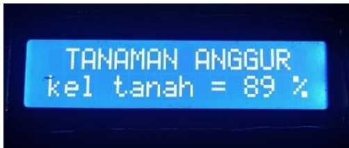
Figure 3.3 Display of soil moisture on an LCD with 89% humidity