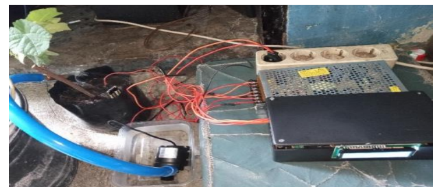
Fig. 3.1 Automatic vine sprinkler based on Arduino uno using soil moisture sensor

The results of the system can be seen in Figure 4.1 which is the original image of the device that has been built. Where Arduino uno, relay, LCD, resistor, LED lamp, arranged in such a way in a black box with a size of P = 18 cm, L = 9 cm, T = 5 cm. Besides the black box there is a 12v Power Supply, terminal, water tank, pump, soil moisture sensor that is plugged into the vine.