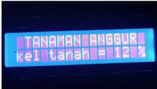
Figure 3.2 Display soil moisture on an LCD with a humidity of 12%