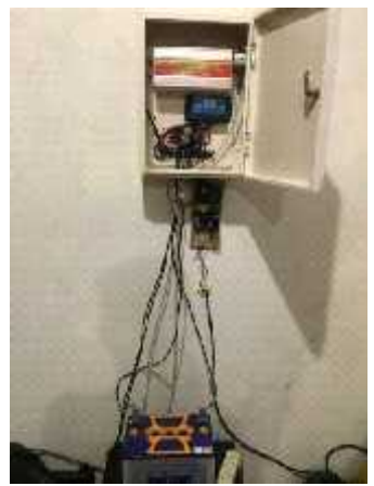
Figure 2. PV Grid Assemble

The assembly results in this study are shown in the figure 2.