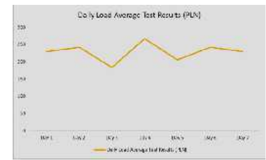
Figure 4. Graph of Average Daily Load Test Results (PLN)

From the results of the calculation of the average load testing carried out for 7 days with PLTS, the highest load testing measurement can be obtained on the first day with a load result of 405.32 watts. While the results of the calculation of the average load testing with PLN get the highest results, namely 229.38 watts. With the results of the highest load test, it can be said that the development of a solar power plant (PLTS) using a 3000 watt inverter can be said to be very safe, because PLTS can meet electricity consumption for household needs with a predetermined time duration from 06:00 WIB until 13:00 WIB.