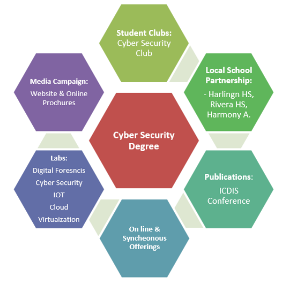
Figure 3. CS Degree Support

With a new degree comes the need for several support services and activities. In addition to administration and faculty recruitment, the areas showed in Fig. 3 were addressed and tackled in detail in systematic way. The following sections deal with the details.