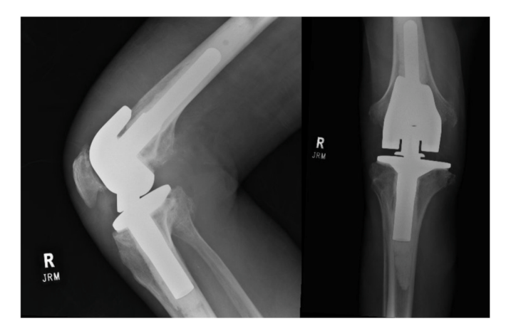
Fig. 2. Preoperative Anteroposterior and Lateral radiographic views of knee prosthesis.

At two months, patient underwent second-stage revision to rotating platform hinge distal femur replacement. At 10-week postoperative exam, patient was without signs of infection. The medical plan was for suppression on levoquin and ambulation pain-free without assistive devices with active ROM 10-100. During admission for reimplantation he was noted by infectious disease specialist to have a subcutaneous 2 cm mass on his upper back which was incised and found to be purulent. He was treated with IV antibiotics for two weeks for this before suppression continued. CRE is thought to be the source of his original infection, as he noted it being there for possibly years, which would explain his atypical species.