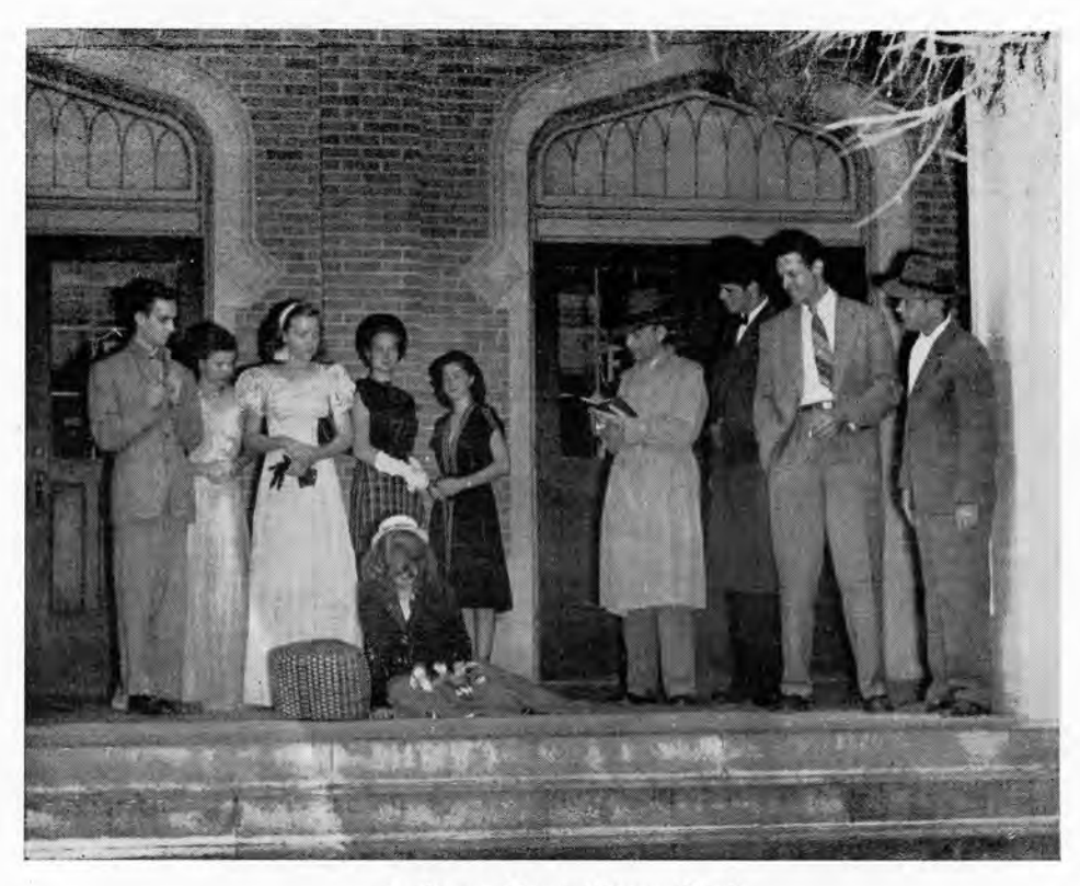
A Scene From "Pygmalion"

Some of the road trips already scheduled for the coming year are as follows: football—Mexico City, Laredo, Victoria, and Brownsville; basketball—Laredo, Uvalde, Corpus Christi, and Brownsville; track—Laredo twice and possibly Corpus Christi and Brownsville; boxing—Harlingen and Brownsville; tennis—Laredo; and baseball—Laredo, Uvalde, Wharton, and Blinn Junior College