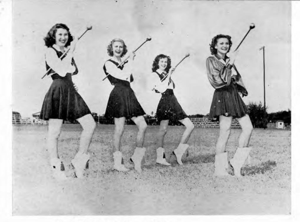
E. J. C.'s Drum Major and Twirlers