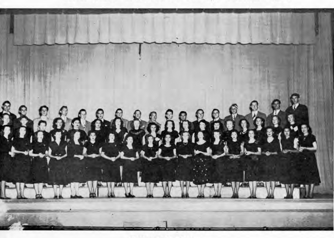
College Glee Club