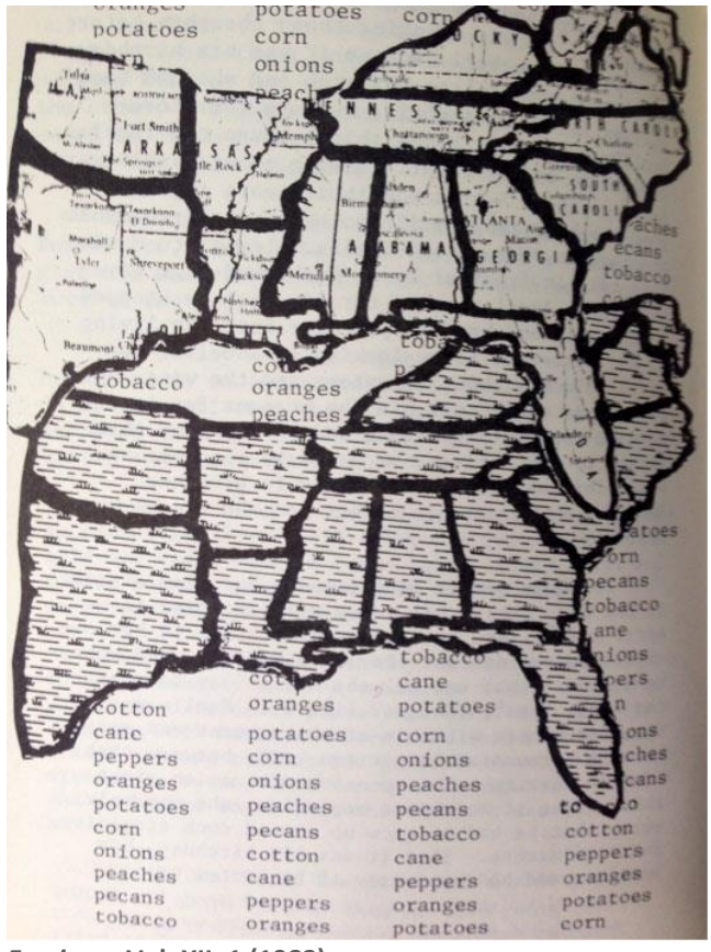
Feminary Vol. XII: 1 (1982)

surrounding what comes out of our bodies are commonplace considerations of materiality, as our eating bodies are constantly in flux. Similar changes could be said of our bodies during and after sex. In Racial Indigestion: Eating Bodies in the 19th Century , Kyla Wazana Tompkins demarcates the boundaries between food and eating, calling scholars to shift toward a framework that weds food studies to body theory, allowing a "critique of the political beliefs and structures that underlie eating as a social practice." Eating functions simultaneously as a cultural process and a biological one, as the body maps desire, appetite, and erotic/alimentary pleasure alongside the production of group formation, affirmation, and delineation. The medium for the map is southern food, as exemplified by this sketch from a 1982 issue of the southern lesbian feminist journal Feminary , where southern foods and crops are literally mapped onto a state demarcated region.