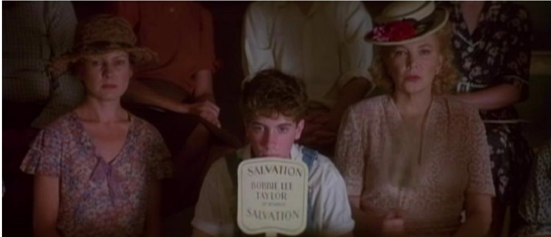
From The Neon Bible, dir. Terence Davies (1995)

A good example of how Davies maintains the spirit of the novel can be found in his interpretation of the passage from the book that describes when Frank (David's father) knocks his mother's tooth out in a fit of anger. Frank, who at this point has lost his job and has, out of desperation, taken on part-time work at the local gas station, returns home with the unsettling news that he has spent his week's pay on seeds to follow through with what his wife calls a "crazy plan to grow things on the hill" near their home (Toole 29). Frank's mother Sarah has been waiting on his father's return all day because the family is too broke to even buy food. In fact, the only money they have in the house is "twenty-three cents" that young David keeps in his piggybank. David's mother refuses to take the boy's coins, and she has promised her young son that once his father comes home, there will be "money with him" to buy what they need (28). Yet, when Frank arrives home, he has already spent all of his paycheck. Sarah grows dismayed and angry upon learning that he used the money to buy seeds (to fuel what she clearly sees as a pipe dream) instead of giving the money to her to buy much-needed food. Consequently, there is a heated confrontation.