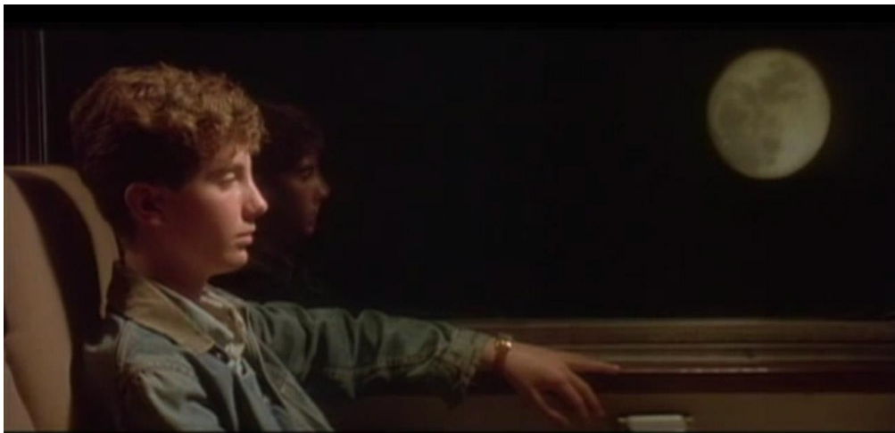
From The Neon Bible, dir. Terence Davies (1995)

century. Coming of age in rural Mississippi, David gradually learns the difficult lessons about religious intolerance while he also begins to confront the pervasive stereotypes that persisted about race, gender, and social class. He does this as he bears witness to his father's escalating physical abuse of his mother, which takes place across several scenes as the family, already in a precarious financial situation, faces bigger economic woes after his father loses his blue-collar job. Since this literary work is highly autobiographical, it works as an outlet for Toole to reflect back on his own coming of age and burgeoning awareness of the region. In this sense, the novel provides an interesting perspective on both Toole's own early years while also shining a light on competing perspectives about southern culture.