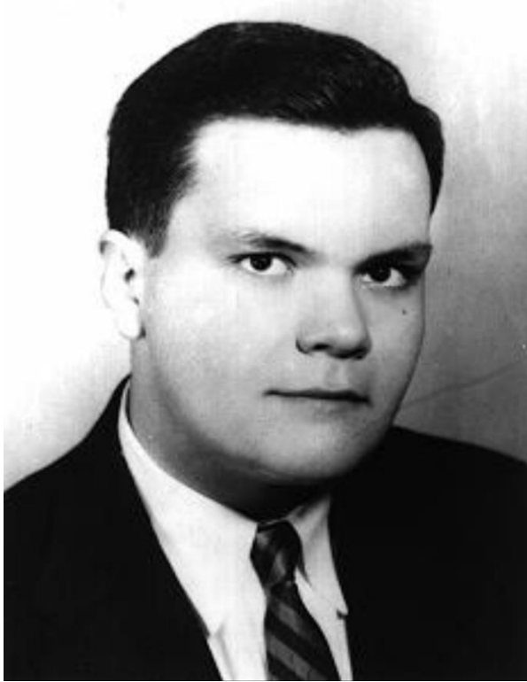
Photo of John Kennedy Toole

Confederacy of Dunces (1980), two literary works that critique, while also calling attention to, stereotypes about the American South.