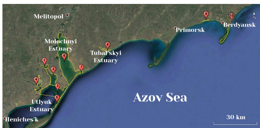
FIG. 1: Map of research polygons (the boundaries of the polygons are marked by yellow color, the number of each polygon is marked in the red labels)

Field researches and sampling was carried out during 2010–2019 on the ten polygons within the PNNP territory (Fig. 1). The polygons were located in the Zaporizhzhja Region, within the Dnieper-Azov geobotanical district (Didukh, Shelyag-Sosonko, 2003). According to algofloristic zoning, the territory belongs to the European algofloristic region, the Eastern European algofloristic province, the Black Sea-Azov district (Palamar-Mordvintseva, Tsarenko, 2015).