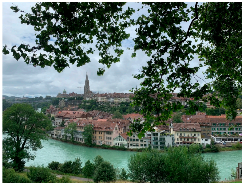
Figure 1. City of Bern.

Both cities place a high value on preserving their historical cityscape. Therefore, both host large-scale ensembles and monuments on their territory that are recognized as UNESCO World Heritage Sites. The medieval city center of Bern was added to the UNESCO World Heritage list in 1983. Potsdam's and Berlin's Prussian gardens and palaces were awarded the same status in 1990. Besides the significance of the UNESCO World Heritage, Bern and Potsdam share other characteristics (see Figures 1 and 2). They are mid-sized cities of roughly the same population size located in advanced democracies in Central Europe. Both are university cities with a strong and diversified research environment and an economy that is dominated by service industries. Furthermore, both cities have acquired the reputation of being forerunners in climate governance within their countries [54] (see Table 2).