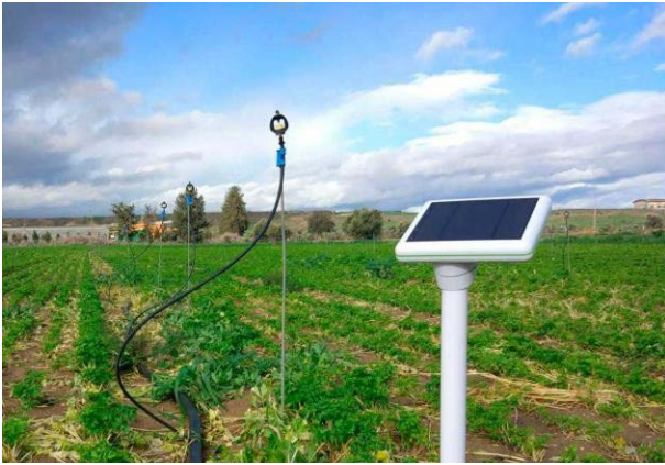
Figure 4: Monitoring of climate conditions

examples of such agriculture IoT devices are all METEO, Smart Elements, and Pycno.