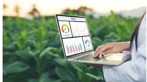
Figure 2: Precision farming using IoT

Precision farming is a manner or an exercise that makes the farming process greater correct and managed for raising live stock and growing of crops. The use of IT and items like sensors, self-sustaining automobiles, computerized hardware, control systems, robotics, and many others. In this technique are key additives. Precision agriculture inside the latest years has turn out to be one of the maximum well-known programs of IoT in agricultural area and a massive range of groups have started using this approach around the arena.