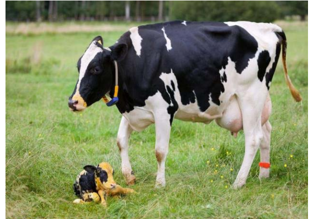
Figure 5: Cattle monitoring and management

Just like crop monitoring, there are IoT agriculture sensors that can be connected to the animals on a farm to reveal their fitness and log overall performance. This works similarly to IoT gadgets for petcare. For example, SCR by Allflex and Cow Ia ruse smart agriculture sensors (collar tags) to supply temperature, health, hobby, and nutrition understandings on each person cow as well as collective records approximately the herd.