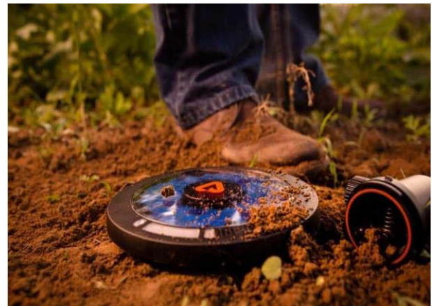
Figure 6: Cattle monitoring and management

One more kind of IoT product in agriculture and some other detail of precision farming are crop control gad gets. Just like climate stations, they should be located inside the field to collect records particular to crop farming; from temperature and precipitation to leaf water capability and typical crop fitness. Thus, you can display your crop growth and any anomalies to correctly prevent any diseases or infestations which could damage your yield. Arable and Semios can serve as precise representations of how this use case may be applied in actual life.