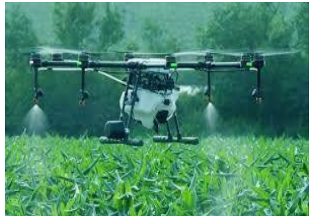
Figure 3: Smart farming using Drones

introduction of agricultural drones is the trending disruption. The Ground and Aerial drones are used for assessment of crop fitness, crop monitoring, planting, crop spraying, and field evaluation. With right strategy and planning based on actual-time facts, drone generation has given a high upward push and makeover to the agriculture industry. Drones with thermal or multi spectral sensors pick out the areas that require changes in irrigation. Once the plants begin developing, sensors imply their health and calculate their plants index. Eventually clever drones have decreased the environmental effect. The consequences were such that there has been a large reduction and much decrease chemical accomplishing the groundwater.