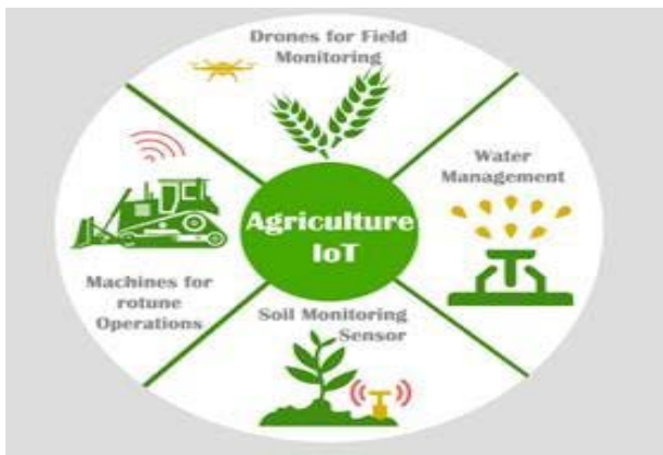
Figure 1: Internet of Things for Agriculture

Smart Farming majorly depends on Internet of Things (IoT) as an importance casting off the need of biological landscapes of growers and cultivators and therefore growing the productivity in every attainable means. In this paper we look at the effect of IoT in agriculture.