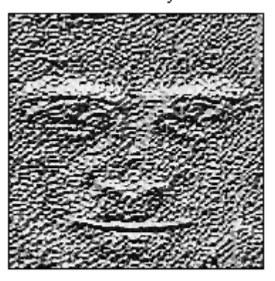
Figure 2.4: Positional ternary Pattern