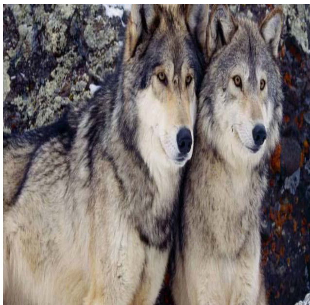
Fig 4 : Grey Wolf