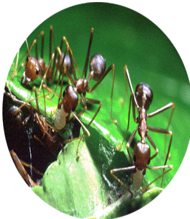
Fig. 2 : Artificial Ants