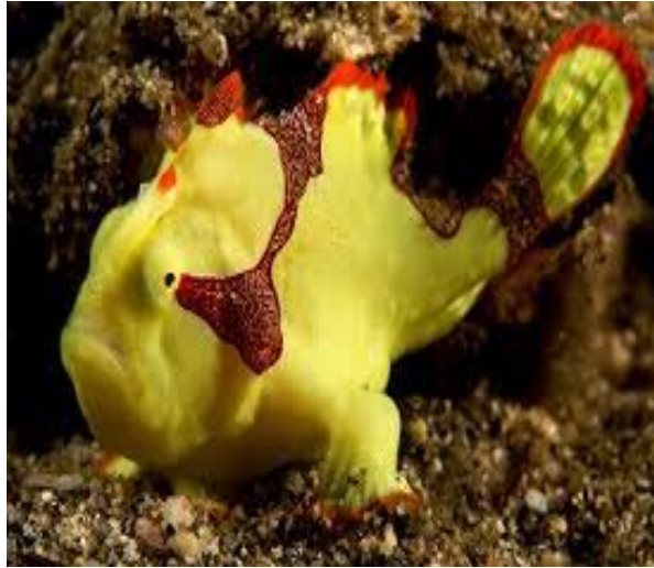
Fig. 1: Warty Frog Fish

of species is in the Indo-Pacific region, with the highest concentration around Indonesia. Frogfish live generally on the ocean floor around coral or rock reefs, at most up to 100 m deep.