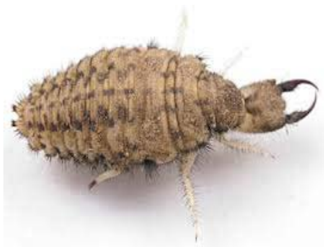
Fig 3 : Ant Lion

The adult is thus rarely seen in the wild because it is typically active only in the evening. The life cycle of the ant lion begins with oviposition. The female ant lion