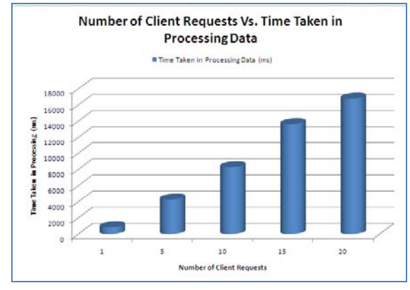
Figure 4 : Graph showing time requirements for Processing of data after verification process in proposed work

From the graph in figure 4 time taken in processing of data after verification process is completed is shown. The graph shows that as the number of clouds increase and the data transferred between them is also increased and it results in linear increase in time with the number of clouds. This is also as per the expected outcome over the cloud environment.