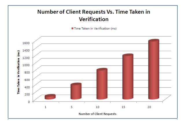
Figure 3 : Graph showing time requirements for verification process in proposed work

The algorithm is performing better in all situations such as a cloud is performing mal activities, cloud become malicious after a while or a cloud is not at all malicious.