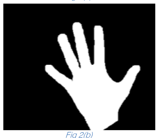
Fig 1 : (a) and 2(a) original picture and fig 1(b) and 2(b) segmentation result