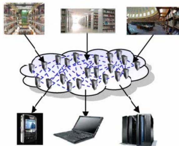
Figure 3 : Application of Cloud Computing in University Library

With the rapid development of various IT technologies, users' information requirements are increasingly personalized. And now more and more libraries advocated user-centered services. So librarians should mine and study users' information requirements frequently. And only in this way, they can master the basic demands of their users. And furthermore, library can develop itself according to such information and improve users' satisfaction. University library, as we all know, is famous for its academic and teaching influences. And IT technology has been the driving force of library development. What's more, librarians can keep using new technology to develop library and optimize library service. With the expansion of Cloud Computing application, this paper proposed to apply Cloud Computing in libraries. By establishing a public cloud among many university libraries, it not only can conserve library resources but also can improve its user satisfaction. And it can be illustrated in figure 3.