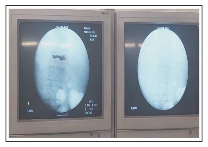
C: cement injected into vertebrae. Figure 1: the intraoperative technique of balloon kyphoplasty. (pictures included with consent)