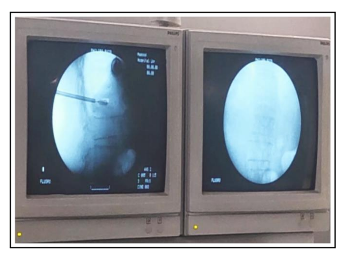
a: Cannula inserted in vertebrae.

During the cement filling the working channel was rotated periodically to prevent the adherence of the channel to the cement. The working channel was removed slowly to prevent leakage of cement into the pedicle. Multiple precautionary measures were taken during the procedure to prevent cement leakage. The procedure was being carried out in local anesthesia so cement leakage into the spinal canal was hazardous. These include thorough preoperative evaluation of the status of posterior vertebral cortex breach, placement of kyphoplasty balloon in the anterior 3/ 4 of VCF, continuous radiological evaluation by C-arm, and making the correct viscosity of the bone cement.<sup>1,8,16,20</sup>