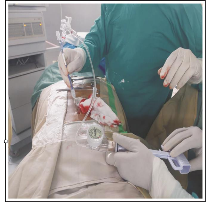
b: Kyphoplasty balloon inflation with pressure gauge and radiopaque contrast. (picture included with patient' consent)