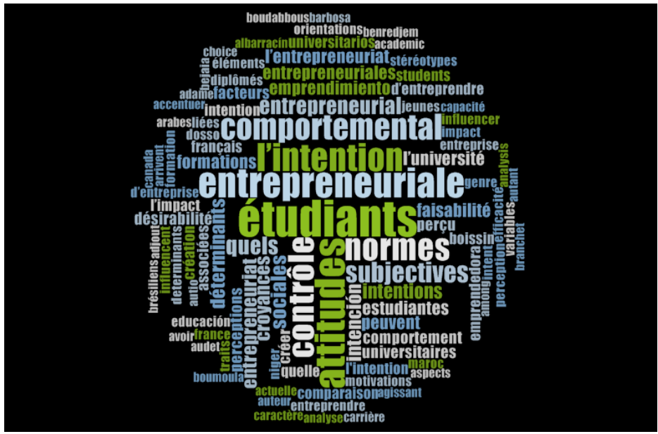
Fig 3. Word frequency generated by Nvivo

Finally, we retain, in the diagram below, the variables that can explain the entrepreneurial intention of university students (Fig 4).