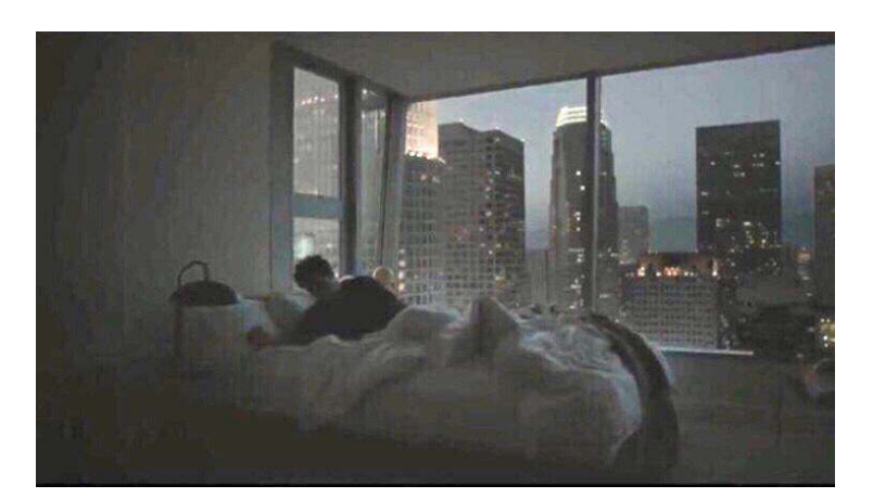
Figure 5. Theodore woke up from a dream