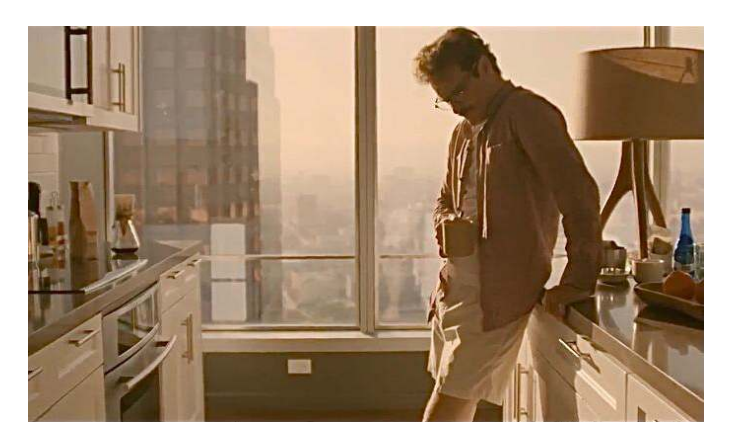
Figure 3. Theodore was unable to eat