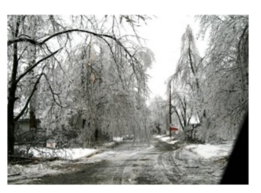
Figure 1. Ice Storm Devastated Horton, Kansas

The things that most successful Extension programs excel at are communicating through media outlets, managing people (particularly volunteers), and coordinating between many different agencies. It turns out those are the most important skills needed in responding to a disaster like the ice storm. Because Brown County Extension was extremely practiced in these efforts, it was not difficult to perform them efficiently and effectively.