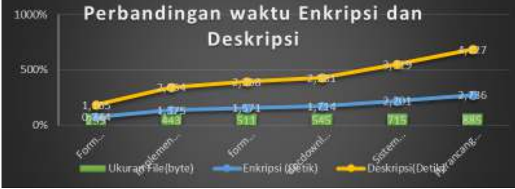
Fig 1 Comparison graph of Encryption and Description time

Based on the table above, the larger the file size, the more time needed for encryption and description, this happens because the larger the message block size, the greater the literacy process required.