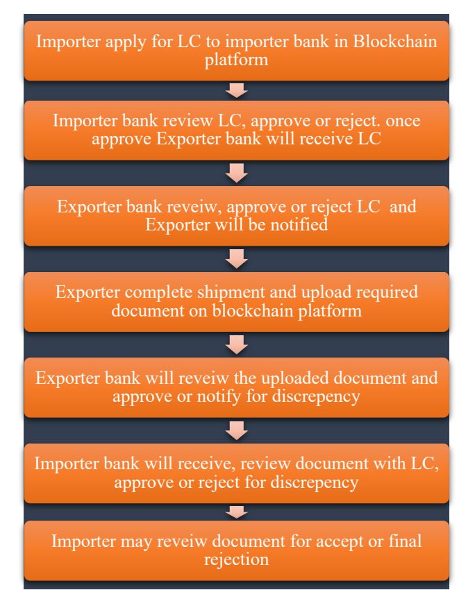
Figure 1: LC in Blockchain application

Contour is one of the Global networks for corporates, banks and trade partners which was formed in 2018 to