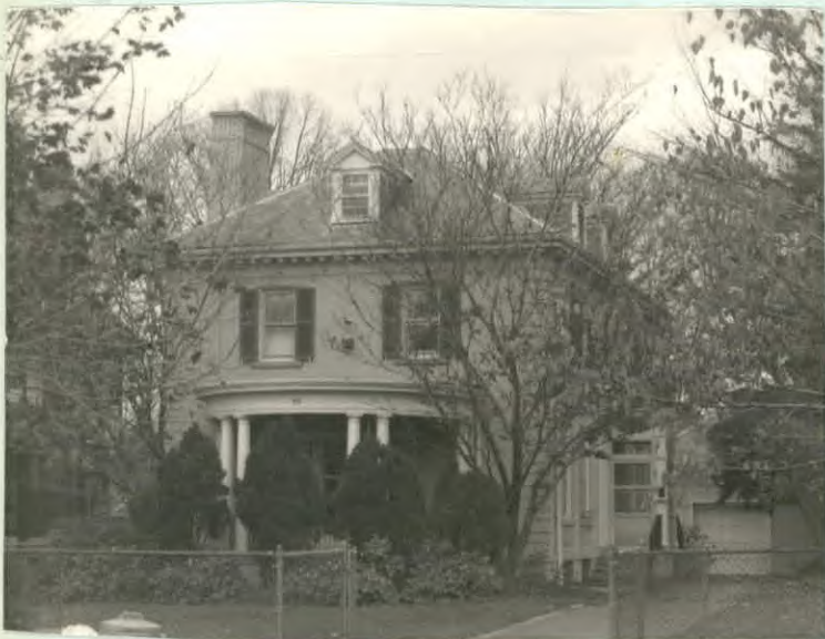
12. PHOTO: 18-22a