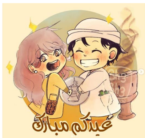
Figure 1: Instagram post taken from @sh3sh3_92, posted on June 5, 2019

Many participants also agreed that another appealing factor of animé and manga was their complex plot, and that, as creators, they had the opportunity to develop their own characters and stories. Two illustrators in particular have developed a digital manga series with their own characters, which they regularly announce on Instagram, and another two create narratives around altercations that are typical in Emirati families.