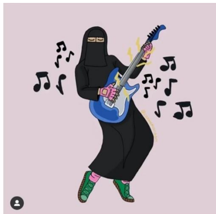
Figure 8 (on the left): Instagram post taken from @mnawrah posted on 12 November 2019