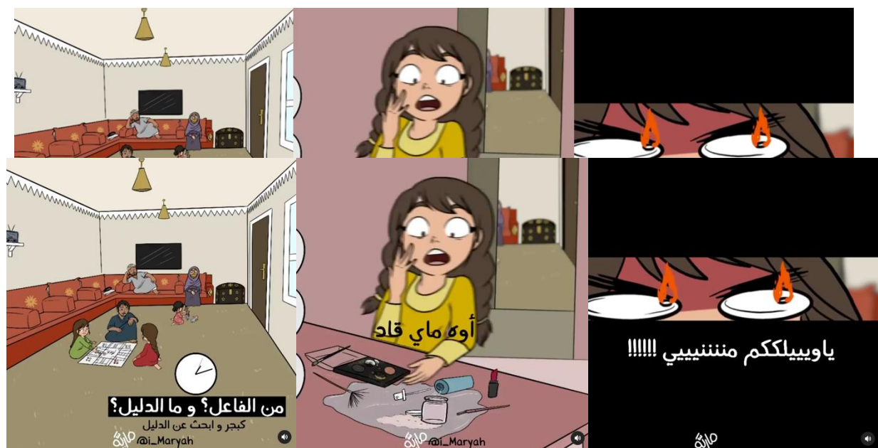
Figure 2: Instagram post taken from @i_maryah, posted on April 18, 2020

It was however observed that the illustrators’ posts not only incorporate traditional attributes, but also show interactions of characters in modern settings: shopping in malls, Driving or racing on highways, ladies spending time at saloons, binge-TV watching or binge-eating with friends ( Figure 3 ) are common activities depicted in these posts.