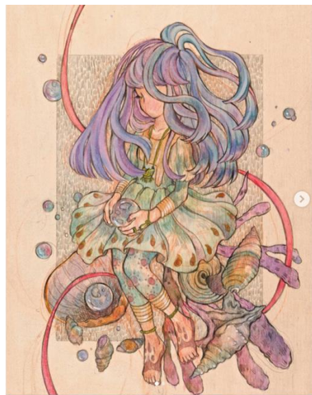
Fig.7: Instagram post taken from @sumaia_alamoodi, posted on October 3, 2018

Focusing on the illustrators' perception of their own art and the message carried within it, two tendencies were also observed. On one hand, a smaller group used art to create a parallel dimension, where characters and narratives function as metaphors for universal values. Researchers such as Chen and Newitz explained that youngsters often consume manga to escape their own reality (Chen, 2004); by becoming otaku, they embrace a new culture, which they look up to in place of their own (Newitz, 1994). This is reflected by those illustrators whose art displays characters that are either purely fantastic or manga-inspired, and where local elements are kept to a minimum. In Figure 7 the only Khaleeja elements include the bracelets around the ankles and wrist of the character and the henna design on her feet.