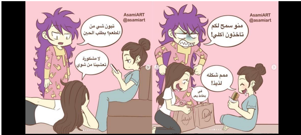
Figure 3: Instagram post taken from @asamiart, posted on 5 October 2019

In these Emirati-centric stories, the characters are often depicted with manga and animé expressionism, such as popping veins, reddening of the face, or big eyes if the character represented is angry or happy, as is visible in both Figure 2 and 3 . Sweat drops to show embarrassment or a nose bleeds to show perversity while different shapes of eyes may carry emotional, aesthetic and moral meanings. These facial expressions were previously identified to be Japanese manga traits in studies by Tomos (2013) and Bryce et al. (2010).