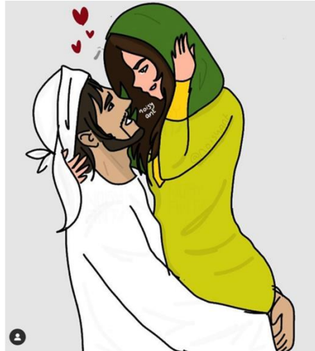
Figure 4: Instagram post taken from @Noisyant, posted on 29 September 2016

The physical proximity and display of feelings between Emirati couples and altercations among family members reveal sentiments that would never be displayed publicly but are, nevertheless, familiar among locals.