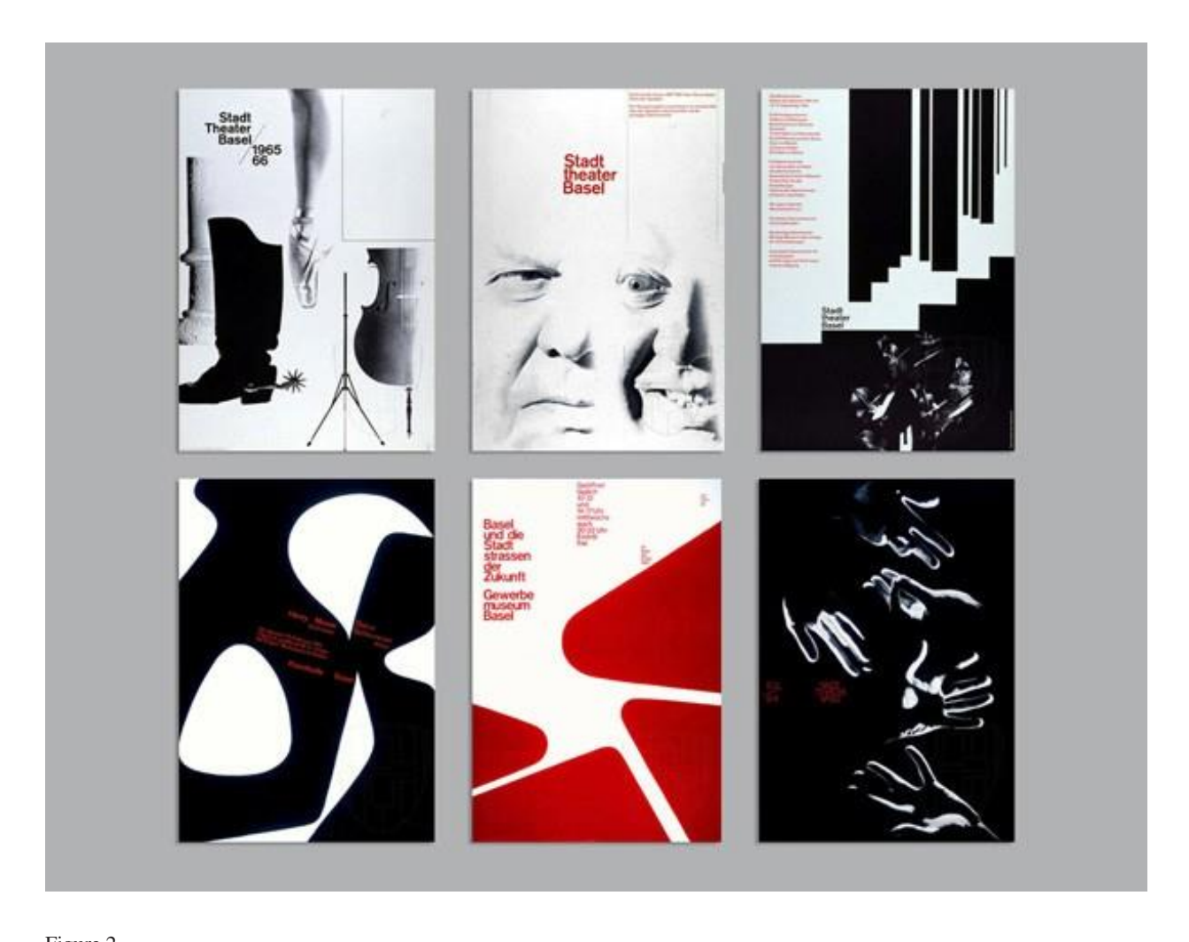
Figure 2 Image of six posters by Armin Hofmann, Various Dates. http://www.designersjournal.net/jottings/designheroes/heroes-armin-hofmann. Accessed 01 July 2019.

theater productions. Note how these theater posters all include the high-contrast, black and white photography to better depict the gesture of performing and playing. Meanwhile, in the two art exhibition posters on the bottom left, Hofmann relies heavily on the abstraction of shape and negative space to convey the exhibit's modern artworks.