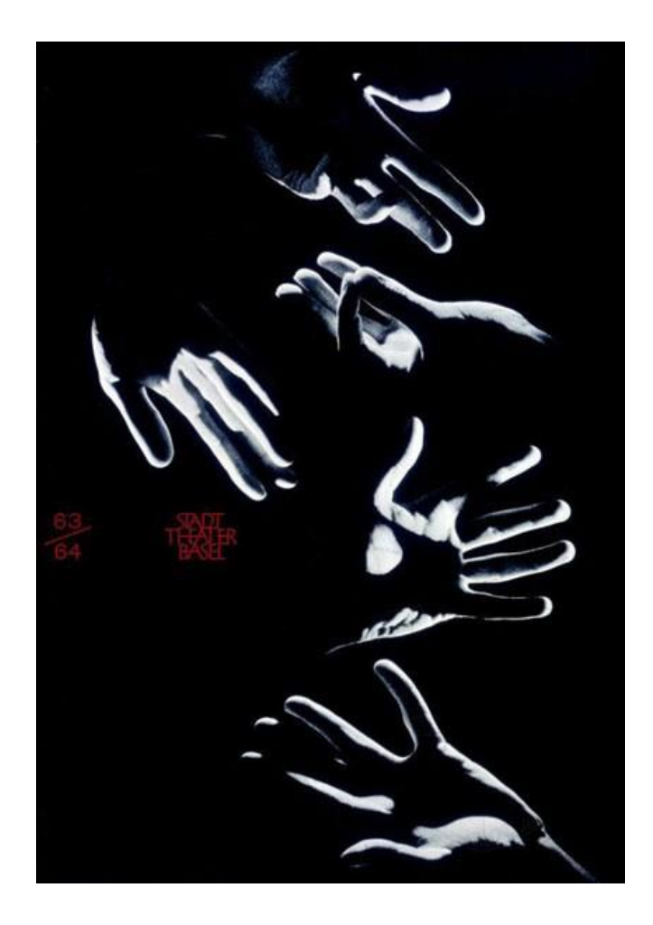
Figure 4 Poster for Stadttheater Basel by Armin Hofmann, 1963. https://www.hypocritedesign.com/armin-hofmann/. Accessed 01 July 2019.

his 'season poster' for the municipal theater shown in figure 4. The simple imagery of the hands