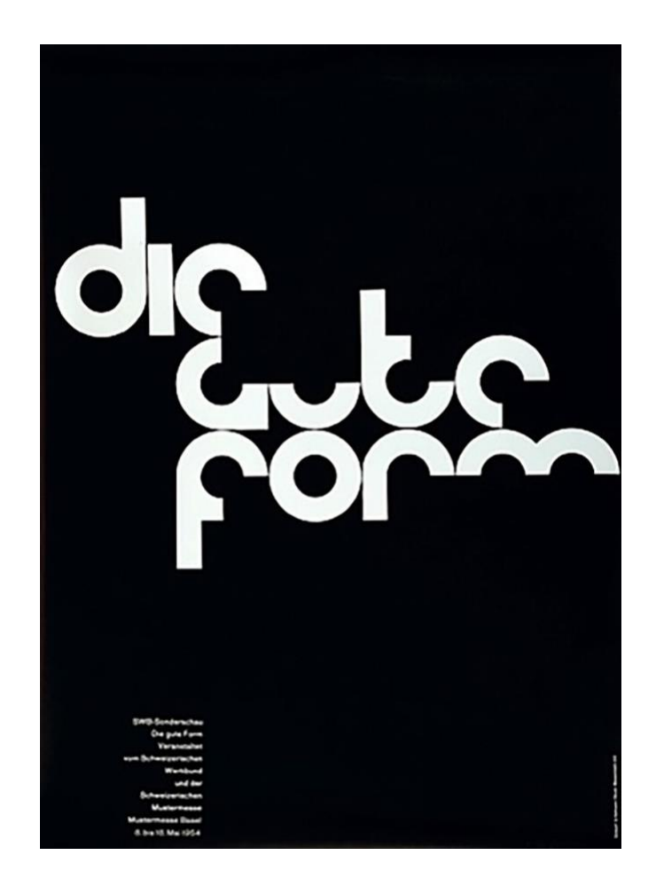
Figure 3 Poster for the "Die Gute Form" exhibition by Armin Hofmann, 1954. https://corvallisreview.blogspot.com/2018/03/oregon-state-graphic-design-series_27.html. Accessed 01 July 2019.

practiced the use of sans-serif typography, asymmetry, simplistic imagery, and high contrast of value in his work. Given that Hofmann was drawn to the power of legibility in letters and their sign-like structures (Hofmann and Wichmann 21), it is of little surprise that he preferred the use of clean, sans-serif typefaces like Akzidenz Grotesk. It appealed to him that viewers' own thoughts are generated and imagery is conceived in their minds upon reading a word or string of words (Hofmann and Wichmann 21). In his minimalist poster "Die Gute Form," or "The Good Form" (figure 3), Hofmann alters rounded, sans-serif typography to