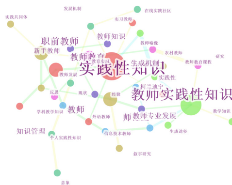
Figure 1 Keywords Co-Occurrence Knowledge Map of Teachers' Practical Knowledge (2004-2021)