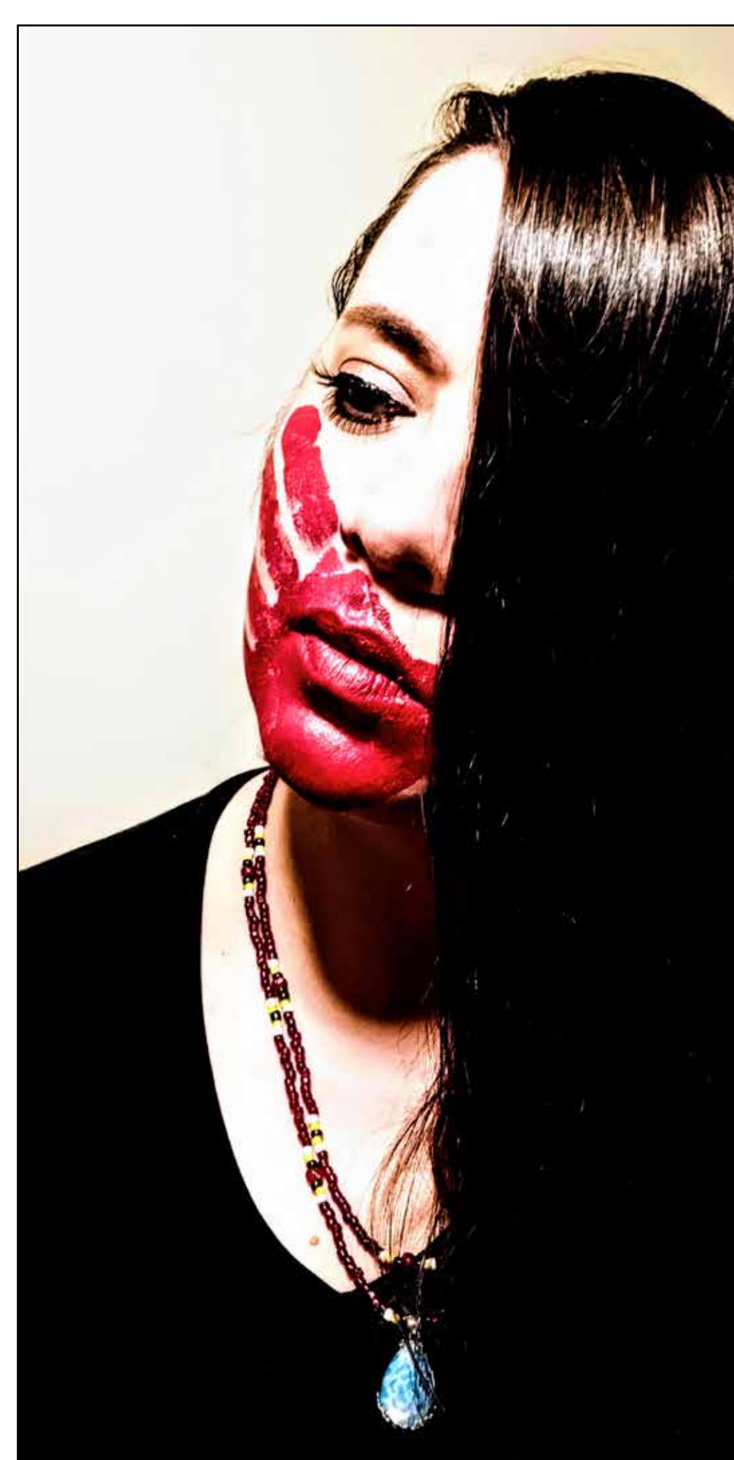
Clockwise, Top Left: #NotOneMore, 2021 Bustle, 2021 Misery, 2021 Soar, 2021