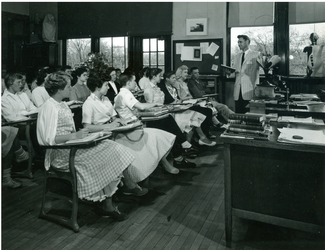
Hope College students and faculty member in class, ca. 1950s

Contact us at (616) 395-7798 • Fax (616) 395-7197 • E-mail: archives@hope.edu • hope.edu/jointarchives