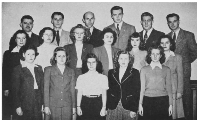
Hope College Scalpel Club, 1946

The pre-medical track was offered in 1925 as individual courses, but female students first picked it as a major in 1938, when two out of six women in STEM took a pre-medical course. Only one other woman was a pre-medical major from 1925-1950; she was a senior in 1945. According to the 1945 course catalog, the four-year pre-medical curriculum had been available to "pre-medical students at Hope College for some time" and was designed to meet the most "rigid requirements of medical schools." 5 Though only these two women listed pre-medical track in the Milestone , some archival files list pre-medical when the Milestone does not, showing that pre-medical track may have been followed by some without declaring it a major, similar to how the pre-medical track works today.