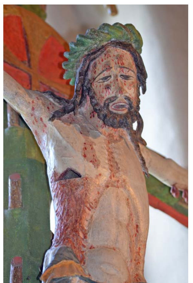
Fig. 8. Crucifix from Taivassalo Church. C. 1340/1350. Limewood, oak and spruce (crossbeams) with fragments of medieval polychromy. Height, figure: 141 cm, cross: 366 cm. Taivassalo Parish.

Caroline Walker Bynum has pointed out that 'in the Northern crucifixes', Christ's blood is usually depicted 'either as falling in a rain of fresh drops or as gushing out in streams – often in the same image'.<sup>39</sup> This is also the case in Marttila Church: a second blood stream is hiding under the carved one. This stream, probably modelled using gesso, flows abundantly from the wound down to the folded edge of the loincloth (fig. 7). It seems to consist of separate, elongated droplets – which are rather modest in style when compared to the Taivassalo crucifix (fig. 8). The crucifixes do not depict the blood as coagulated or drying, but as Sangui Christi , 'alive in death', as formulated by Bynum.<sup>40</sup> The emphasis on the fresh, living blood as an aspect of blood piety and the ico-