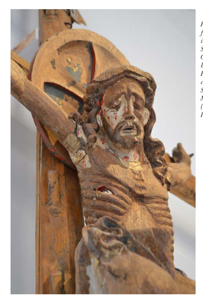
Fig. 12. Crucifix from Botkyrka in Södermanland, Sweden. C. 1325/1350. Oak (figure) and hard wood (cross). Height, figure: 77 cm, cross: 211 cm. Swedish History Museum, Stockholm (SHM14313).