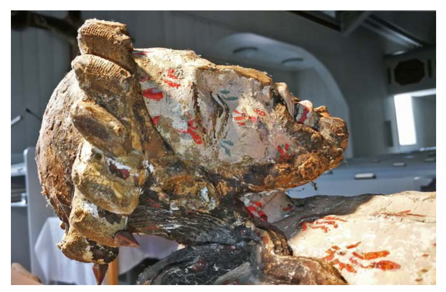
Fig. 3. Detail from the crucifix in Marttila Church. Tears have been painted in the corners of Christ's open eyes. The tip of the nose is missing.

The loincloth wrapped around Christ's waist is skilfully carved, and it creates an illusion of a voluminous fabric: the cloth has horizontal and overlapping folds, which extend from the waist down to the edge of the cloth. There