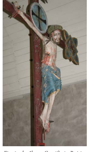
Fig. 6a-b. Above: Crucifix in Raisio Church. C. 1340/1350. Hardwood and softwood (cross). To the left: Remnants of medieval polychromy are visible on the edge of the loincloth, under the 18th century(?) blue and yellow colouring. Height 250 cm.