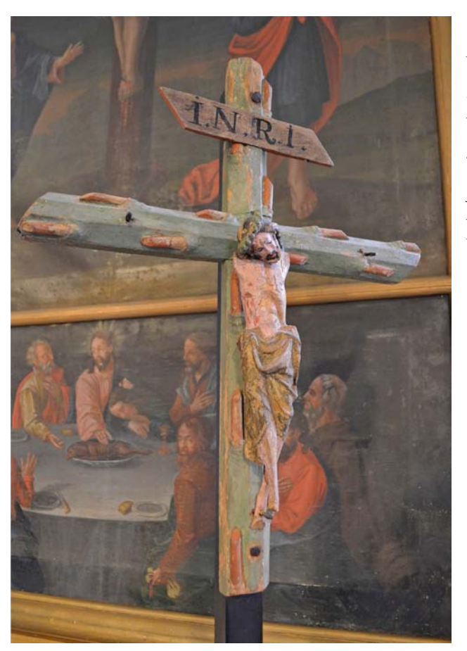
Fig. 11. Altar crucifix in Kustavi Church. Second quarter of the 14th century. Hardwood with secondary and original polychromy. Height, figure: 36 cm, cross: 68 cm. Kustavi Parish.

Many of the medieval crosses have been, in one or another way, altered and demolished or else replaced with a new one. In Taivassalo Church, for example, the crossbars were shortened in the 19th century, but restored to their supposed original colour and length in the 1970s.<sup>53</sup> In Marttila Church, the upper beam of the cross was missing or damaged, and so it was reconstructed in 1952.<sup>54</sup> In