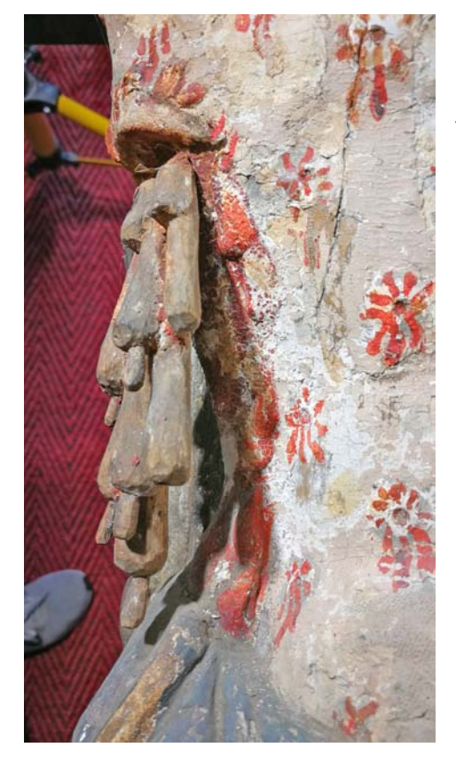
Fig. 7. Detail from the crucifix in Marttila Church, with blood flowing from Christ's side wound. A second layer of blood, which seems to have been modelled using chalk ground, is apparent under the carved grape of blood. The garish cadmium red is from a 20th century restoration.

whereas water represented Christ's divinity. The mixture of wine and water ingested in the Eucharist meal were meant to represent these liquids. ^{38}