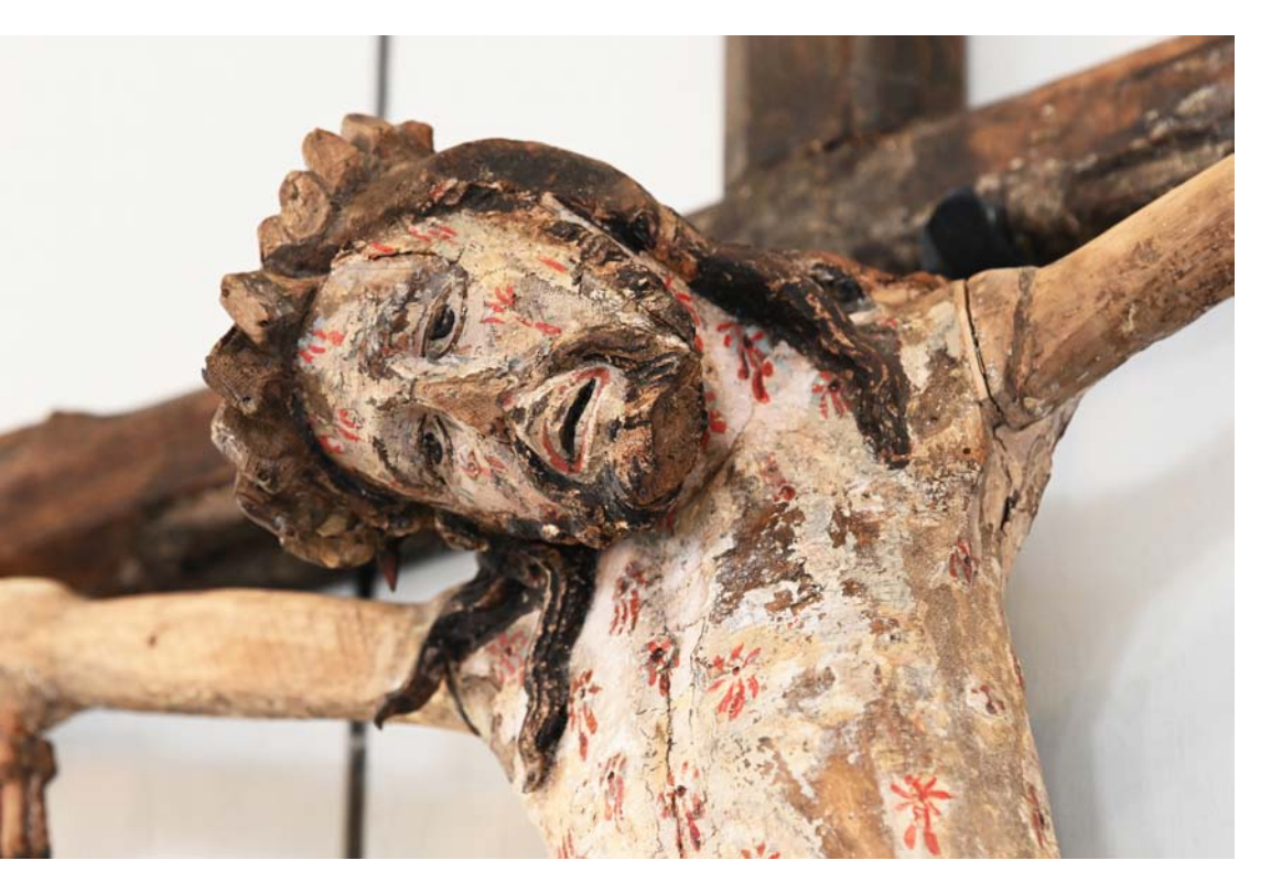
Fig. 2. Detail from the crucifix in Marttila Church. C. 1340/1350. The viewer's attention is drawn to Christ's sorrowful face. Martinkoski Parish.

tled him, and he classified the sculpture – together with ones in Perniö (Sw. Bjärnå) and Tenhola (Sw. Tenala) – as 'horrifying examples of 15th-century crucifixes'.<sup>10</sup> C. A. Nordman was the first to analyse the artwork more profoundly, which he assigned, together with four other crucifixes, to the Master of Lieto (1965).<sup>11</sup> He also acknowledged the proportionally well-preserved and expressive colouring of the Marttila sculpture, arguing also that the workmanship represented the master's greatest artistic achievement.<sup>12</sup> He proposed that the sculptor may have been aware of the Crucifixi Dolorosi (Ger. Leidenskruzifixe ) and discussed their relation to monastic mysticism in Cologne and surroundings areas.<sup>13</sup>