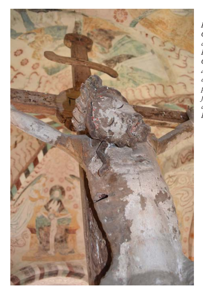
Fig. 9. Detail from the Christ figure in the crucifix from Hattula Holy Cross Church. C. 1340/1350. Hardwood and spruce (cross) with only fragments of medieval polychromy left. Height, figure: 118 cm, cross: 230 cm. Hattula Parish.

When used as a separate devotional image, the side wound usually had a diamond-shaped or oval form, and it was of supposed life-size.<sup>42</sup> This 'true measure' of the side wound could be written on, e.g. a parchment, which was then worn around the neck as an amulet believed to have magical powers and thus protect the carriers against, e.g. diseases, injuries, including blood loss, or sudden death.<sup>43</sup> In the crucifix in Hattula Church the width of the triangular and cavity-like wound is c. 5.5 cm centimetres, and it is painted red on the inside (fig. 9).<sup>44</sup> The rather large size of the wound is actually typical of many images of Christ in the diocese. This may indicate that they had a liturgical function: for example, in the Cistercian monastery of Wienhausen a Host was inserted on