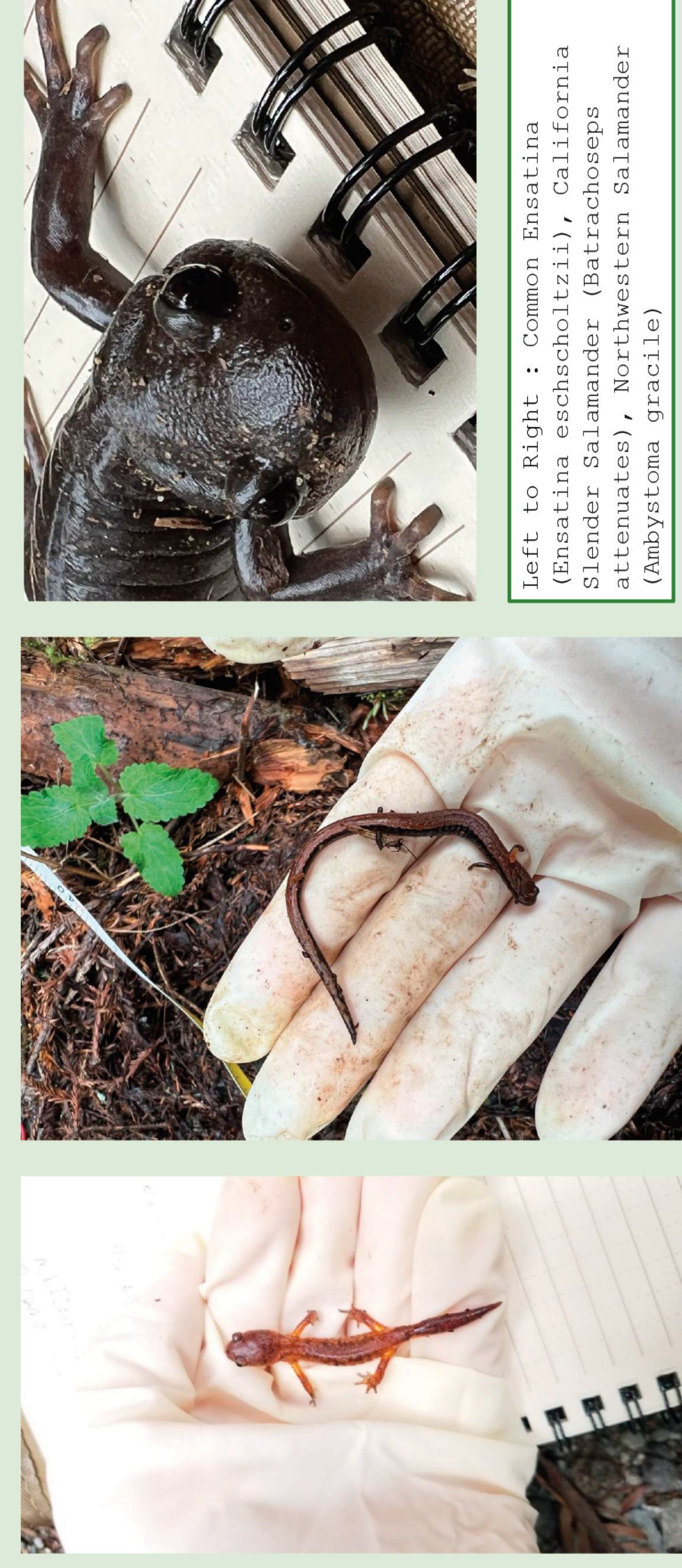
Left to Right : Common Ensatina ( Ensatina eschscholtzii ), California Slender Salamander ( Batrachoseps attenuates ), Northwestern Salamander ( Ambystoma gracile )

A series of 1x1 meter area constrained searches were conducted at distances from 0 to 10 meters away from the trail in a randomized order. The plots were then searched using new nitrile gloves for every salamander. The salamanders were identified, weighed, and measured. The cover object they were found under was returned to their original position and the salamander was placed next to it so it could find its way back under without being squished.