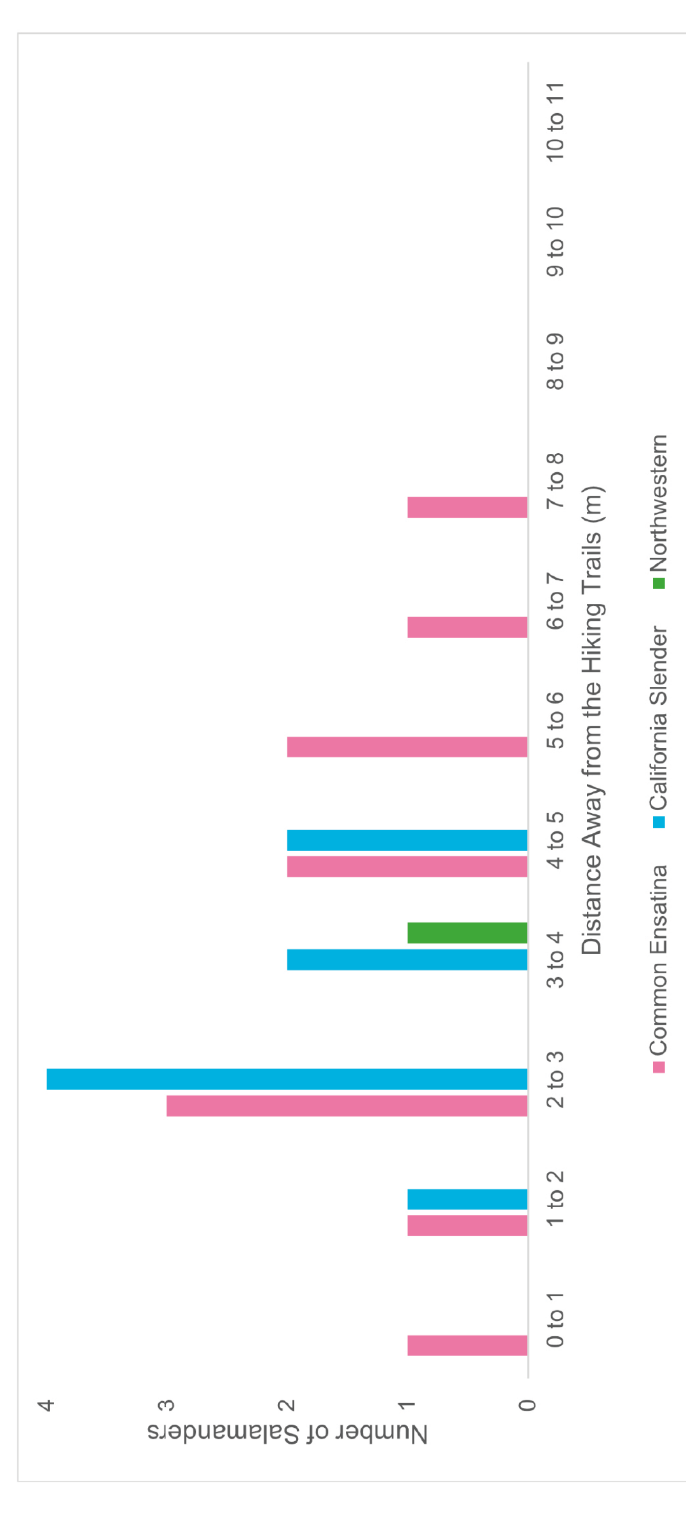
Figure 3. The number of salamanders of each species found at each distance from the hiking trails in Arcata Community Forest, Arcata California, March-April 2022.

There is a higher number of species and a higher number of total individual salamanders closer to the hiking trails. This goes against the second part of my hypothesis; however, this does not mean that they aren't causing harm to the salamanders. The salamanders may be stepped on by people using the hiking trails. California Slender Salamanders become longer and heavier the further away from the trails they are. This could indicate that the younger individuals are using the habitat that is closer to the trail, perhaps this is the result of intraspecific resource competition. If I were to do this study again, I would use a premade 1x1 meter frame to use as the boundaries of the plot to streamline the setup process. I would also like to do a longer study at a different time of year, and I would like to scale up the project and have a team of people helping me.