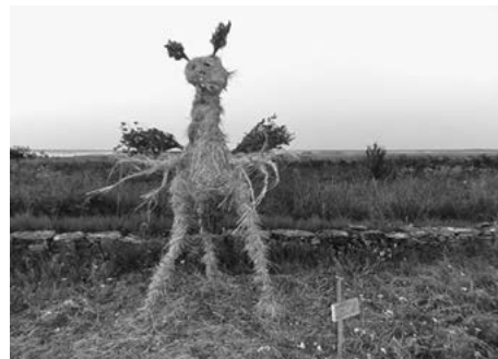
Fig 4. Kratt, an example of community art, 2018