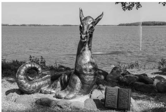
Fig. 5. Tsmok. Monument in Lelepe, Belarus.

Belarusian and Ukrainian traditions contain stories of serpents that walk instead of fly (Levkiyevskaya 2019: 439; TMKB 2011: 486–487). In Belarusian tradition, we find the appearance of a serpent depicted as “shaggy, scary and tall”, yet most importantly it does not fly; it walks, and walks upright, that is, in this description, the serpent possesses the features of both zoomorphic and anthropomorphic creatures. Ukrainian folklore also includes stories of serpents that walk instead of fly (Levkiyevskaya 2019: 439, No. 9). Some remarkable features are attributed to the flying serpents as they appear in flight, emphasising their fiery, luminous nature. Certain changes can be noticed in descriptions of the serpent’s colour, the brightness of its glow, and its shape based on the way it flies and what it is carrying.