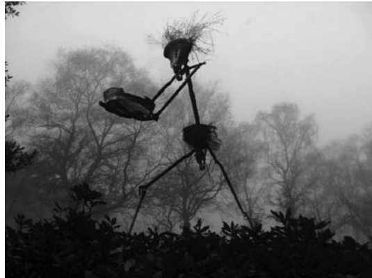
Fig. 2. Kratt in the 2017 fantasy drama film November by Rainer Samet.

– A self-made and animated kratt , which can make it self and be revived by verbal magic and magical actions, sometimes requiring the help of an evil force. Such a mythical being can also be purchased, but since it is a supernatural helper the relationship between the master and the mythical helper is complex. Magical helpers may appear upon reading the Seventh Book of Moses or the Black Book 4 , an ancient religious complex in itself, a famous book of knowledge and power (Eisen 1896; Ljungström 2015; Klintberg 2010: M 85, type P 41–43); Davies 2010; Kõiva 2011a). The self-made creature refers to a complex of witches possessing supernatural knowledge. The tradition of kratt has several parallels with the spiritus , especially legends about difficulties of doing away with a spiritus or kratt .