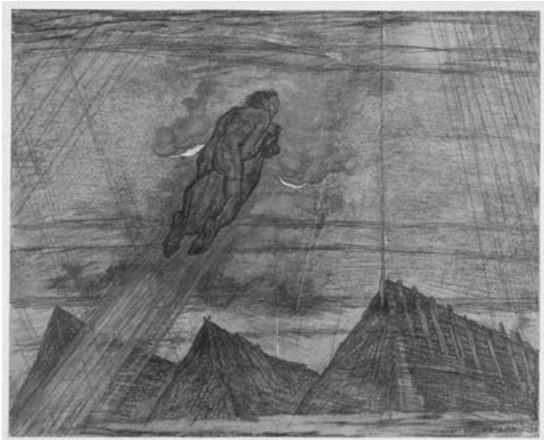
Fig 6. Kratt-bearer, Kristjan Raud, 1927.

The Livonian witches can be invisible when they are sucking milk from a cow, while their shadow can be seen on the barn wall. Loorits gives an example where the storyteller's mother understood that somebody had been sucking on her cow every night. One morning, she went to milk it and on the wall saw a naked man with big balls, which were decreasing; then there was a flash like a flame