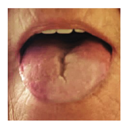
FIGURE 2: Picture of the oral tongue demonstrating left-sided tongue pallor.

with a previously diagnosed systemic sclerosis with digital Raynaud's symptoms [3–8].