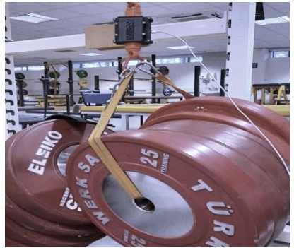
Figure 1. 250-kg hanging from GSTRENGTH strain gauge with output USB connector.

METHODS: Six known loads ranging between 5-250 kg (5-, 25-, 50-, 100-, 200-, 250-kg) using 5-kg and 25-kg IWF calibrated weights training plates (Werksan, Ankara, Turkey, Eleiko, Halmstad, Sweden), were hung off a GSTRENGTH strain gauge (Version 2, Exsurgo Technologies, Virginia, USA) using carabiners and a high strength nylon climbing sling (Figure 1).