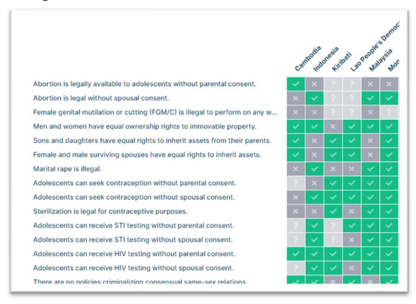
Figure 2 List of policies under the domain of "Gender Norms and Agency" for the "East Asia & Pacific" region.

• Once a "domain" and "region" are selected, the checklist will populate with a list of domainspecific policies (Figure 2).