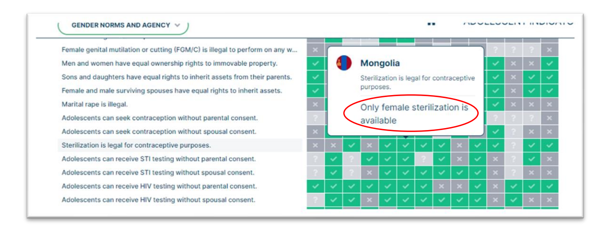
Figure 4 Mongolia has a policy confirming that sterilization is legal for contraceptive purpose—however, only female sterilization is available.

Notes are included in the dialogue box in cases where a policy is technically present according to a database or official documentation but has important exceptions or considerations (see Figure 4).