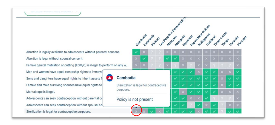
Figure 3 Cambodia has a policy confirming that sterilization is legal for contraceptive purposes.

Notes are included in the dialogue box in cases where a policy is technically present according to a database or official documentation but has important exceptions or considerations (see Figure 4).