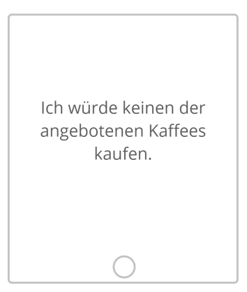
Figure 1: Depiction of a Survey Choice Set (Two Profiles & No Buy Option)

ered important to understand not only which alternatives and levels perform best in relative terms, but also whether they satisfy the participants minimum requirements for a (hypothetical) buying decision (Parker & Schrift, 2011). The disadvantages of adding a no buy alternative (e.g., lower information yield in sets where the no buy is chosen), were deemed less important than the above considerations, especially as most disadvantages can be mitigated by considering the no buy option correctly in the data analysis (Kamakura, Haaijer, & Wedel, 2001).