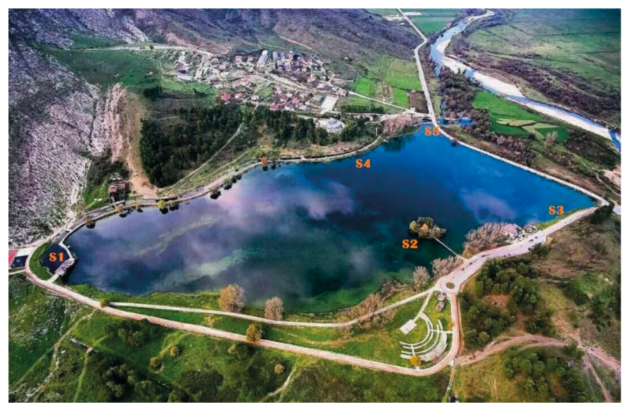
Fig. 1. The study site and sampling stations of the Lake Viroi.

The study site was water ecosystem of Lake Viroi (Figure 1). This lake is located in Gjirokastra district in the south of Albania.