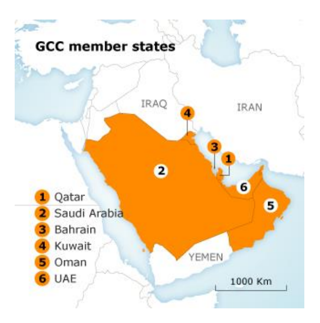
Figure 1. GCC Countries Map

The GCC countries are classified as developed countries because of their Gross National Income. The main revenue of these six countries depends on oil production and export since 1970. The GGC countries produce around 45% of the world's oil and provide around 25% of crude oil exports [24]. Most recently, almost all these countries have embarked on initiatives to diversify their income streams away from oil production and export.