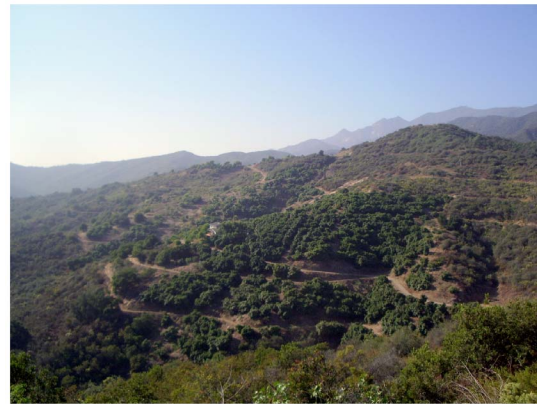
Figure 2. Orchard on hillslope. Typical landscape pattern of steep hills with orchards surrounded by wildlands. doi:10.1371/journal.pone.0068025.g002

were placed in and around 6 orchards (22 sites in orchards and 6 sites in natural vegetation adjacent to orchards) and 2 continuous wildlands (10 sites), with distance to nearest camera between 30–900 meters (mean = 193 meters).