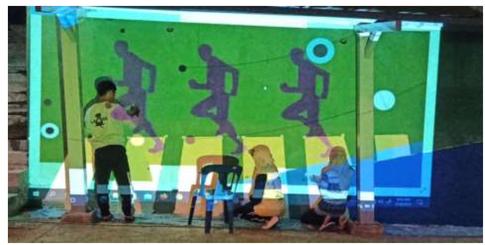
Fig. 2: The actual design process was projected onto the wall during the night and marked by the participating students.