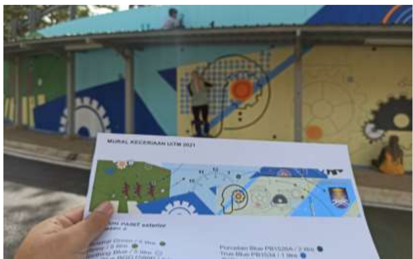
Fig. 3: The process of comparing and rechecking the composition from the actual design to the displayed wall. (Source: Farid Raihan Ahmad, 2022).