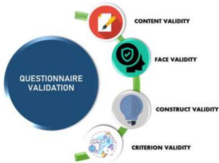
Fig.2: Questionnaire Validation Process

Validation of Learning Malaysian Sign Language Questionnaire (L-MySL-Q) entails four validation steps: content validation, face validation, construct validation, and criterion-related validation, as depicted in Diagram 1.0. To assess the quantitative content validity of the questionnaire, seven people participated in the panel of experts: 1 education expert for the special needs community, one education expert, one medical researcher, and four academic researchers to review the questionnaire and exchange views in a face-to-face meeting. Experts were told that the questionnaire would be an evaluative tool designed to gauge the willingness and readiness of educators and students to adopt MySL as a third language in mainstream schools. After carefully studying the questionnaire, they were asked to consider and comment on the four criteria of clarity, simplicity, transparency, and relevance of items to access willingness and readiness. Then, L-MySL-Q was amended according to the expert feedback and used in the face validation. Finally, L-MySL-Q was amended according to the expert feedback and used in the face validation.