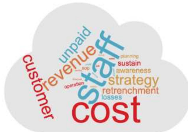
Fig. 1: Most frequent words mentioned by the respondents.

interviews, reflecting that these hospitality managers were concerned about employees' welfare since the COVID-19 has affected the quality of life of their employees (e.g., unpaid leave, salary cut, retrenchment).