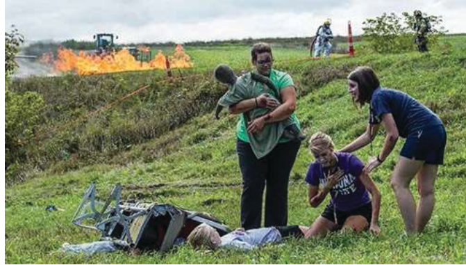
FIGURE 1 Triennial exercise at Rochester International Airport, August 2015.

Firsthand experience trying to keep pace with a story—and possibly get ahead of it—was deemed highly beneficial.