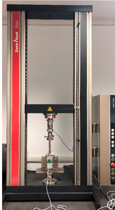
Fig. 1. Zwick testing equipment.

All the specimens were tested under crack mouth opening displacement-controlled three-point-bending tests using a Zwick-Line testing equipment, Fig. 1. A displacement rate of 0.005 mm/min was used. After this test, the two broken halves of each specimen were tested in compression. In this case the displacement rate used was equal to 0.5 mm/min.