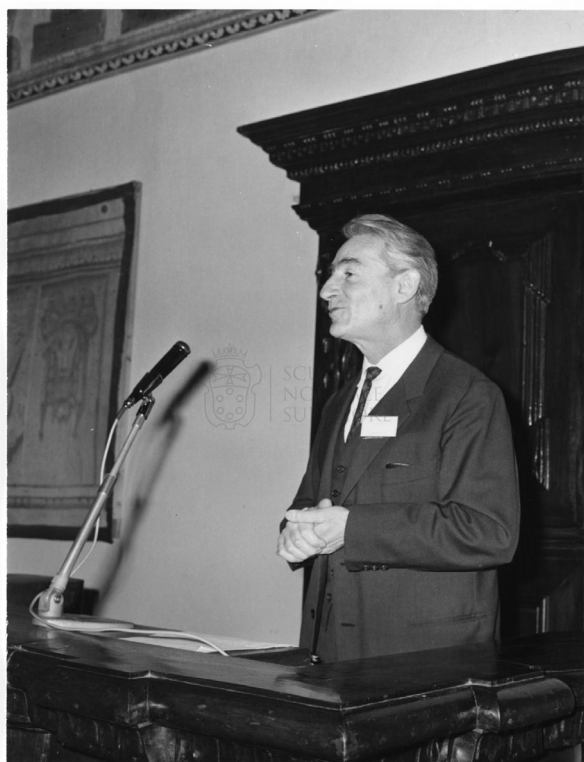
FIGURE 1 Gilberto Bernardini addresses the audience at the Pisa meeting in April 1966, Raccolta fotografica Scuola Normale Superiore, Meeting, Meeting on European Collaboration in Physics 16-17 Aprile 1966, Centro Archivistico della Scuola Normale Superiore, Pisa, Italy