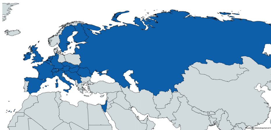
FIGURE 4 National membership of the EPS, as represented by the official national bodies that signed the constitution on September 26, 1968. This map has been realized using historicalmapchart.net ( https://historicalmapchart.net/world-cold-war.html ), retrieved June 20, 2018 (CC BY-SA 4.0). National borders in historical periods were, of course, a matter of political controversy and diplomatic negotiations. This is certainly the case for the identification of the Sinai region as part of the Israeli state after the Six-Day War. The author does not intend to make, or share, any claim concerning the geopolitical description conveyed by the tool employed. This is simply a representation of the membership of the EPS in 1968 [Color figure can be viewed at wileyonlinelibrary.com ]

the EPS. 112 Whatever position they expressed during the discussion, everyone agreed that, in this more strategic sense, founding the society was itself a political act. Even though some protested, the final decision was to found the society as planned, with only a weak mention of the ongoing political situation in the letter of invitation to scientific institutions.