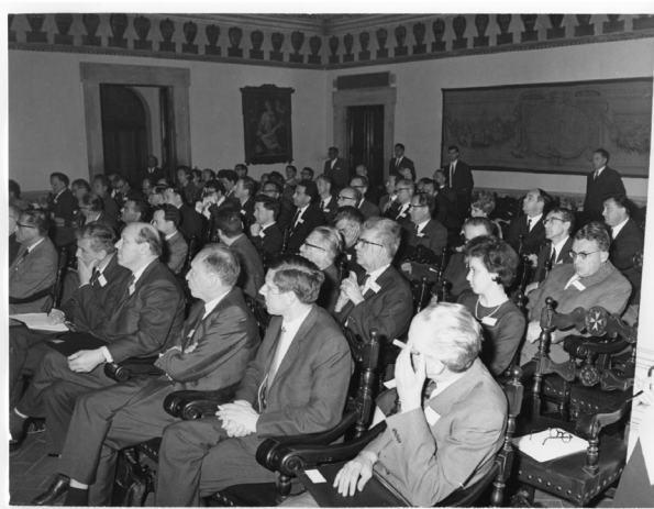
FIGURE 2 Participants at the Pisa meeting in April 1966, Raccolta fotografica Scuola Normale Superiore, Meeting, Meeting on European Collaboration in Physics 16-17 Aprile 1966, Centro Archivistico della Scuola Normale Superiore, Pisa, Italy

Italian government. Sponsored by the president of the Italian Republic, Giuseppe Saragat, the meeting was attended by about 90 physicists (Figures 1 and 2). 42