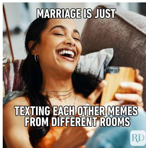
(b) not misogynous meme.

Figure 2: Two memes from test set depicting a woman in the foreground. The image-only baseline model classifies both memes as misogynous, probably due to the presence of a woman as main element in the picture. On the other hand, our best performing model predicts the appropriate label, demonstrating that the text is definitely needed to correctly classify these type of memes.