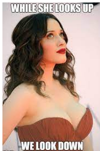
(a) misogynous meme.

Figure 1: two example of misogynous memes where one of the two modalities, image in (a) and text in (b), contains neutral and /or not useful information according to the task goal. These memes highlight the importance of a multimodal approach.