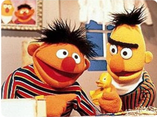
(a) Meme with a neutral image and offensive text.

Ernie and Bert proudly displaying the rubber duck they inserted into the screaming hooker earlier