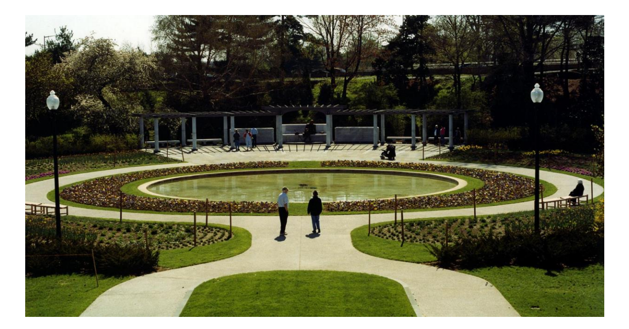
Figure 4: George Mason Memorial, photo by Stewart Bros. Photography, National Mall. Washington D.C., DavisConstruction.com

Realistically, all memorials are manufactured for ease of conceptualization and simplicity of design. Art is a subjective medium and the intention of interpretation is vague. Any element of a project can be deemed artistic choice and thus manufactured and is found in Figures 4 and 5.