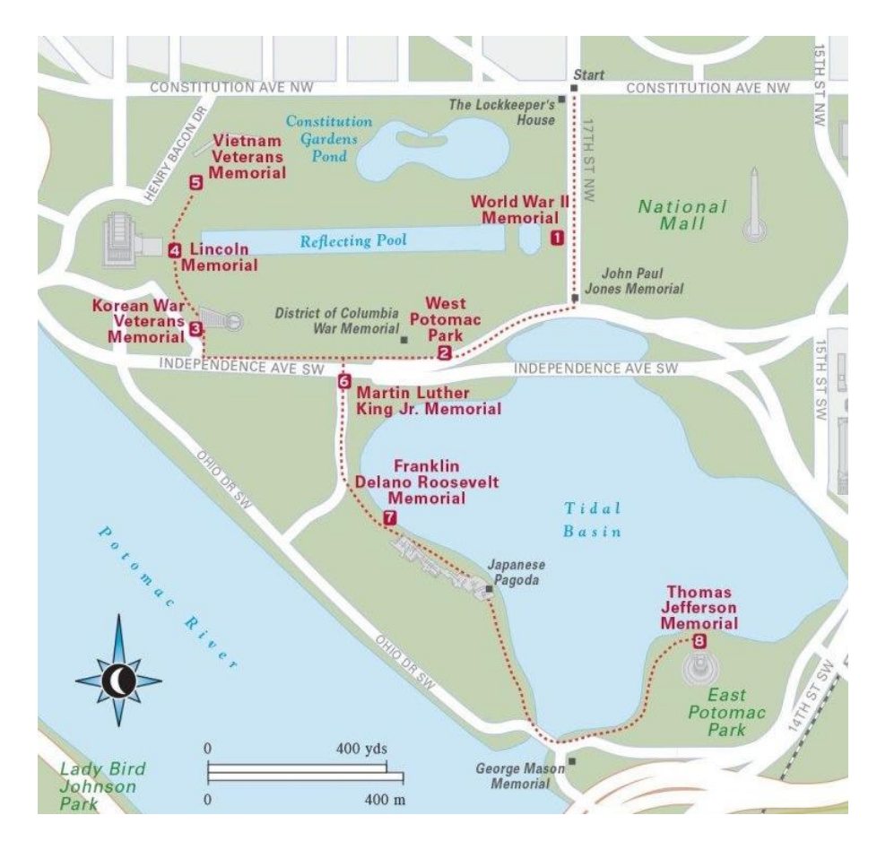
Figure 3: National Mall and Memorials Walking Route, 2021, National Mall, Washington D.C.

Scholars identify a few common arguments within the literature of the memorialization theory about the National Mall. Using Bruggeman's words as a reference, memorials are monuments that are important for protecting a nation's fundamental concepts such as stories of the past, life lessons, public memory, and nationalistic views. Statues, cemeteries, obelisks, historic buildings, memorial bridges, national parks, rituals, and other monuments are found across the United States and across the world as sentiments to important events.<sup>17</sup> These different formats represent the individual and collective connections the public has with memory and