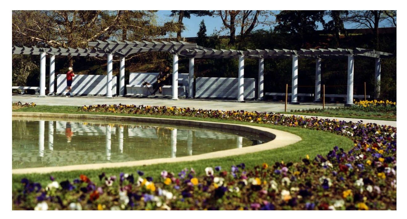
Figure 5: George Mason Memorial with the 14th Street Bridge in the background, photo by Stewart Bros. Photography, National Mall. Washington D.C., DavisConstruction.com

The harmony of the circular structure of the garden leads the people through the memorial. The shadows of the bridge and the water in the fountain offers a quiet atmosphere for reflection. The placement of the statue at eye level gives a sense of relatability and open access to Mason's character and the inscriptions strengthen a national identity. Whatever the potential interpretation of the side may be, the simplicity or complexity of the site man it embodies is not a strange concept across the National Mall. Harmony, strength, respect, and aloofness is a shared element with the other founding fathers. Looking back, the design choices are unclear as to whether the manufactured aesthetic exists until the public opinion is explored among the pages of various journals and newspapers published in 2002 and 2003.