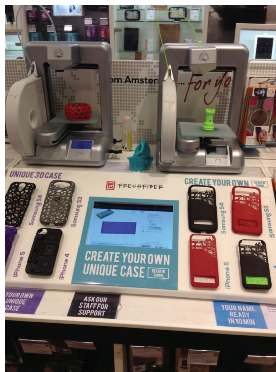
Figure 1. 3D Printer in an Amsterdam shop, 2013 (original image by Fabrizio Valpreda).

These features set new paradigms of use, which in some conditions could disrupt the industrial traditions we had been accustomed to. Serial production is no longer