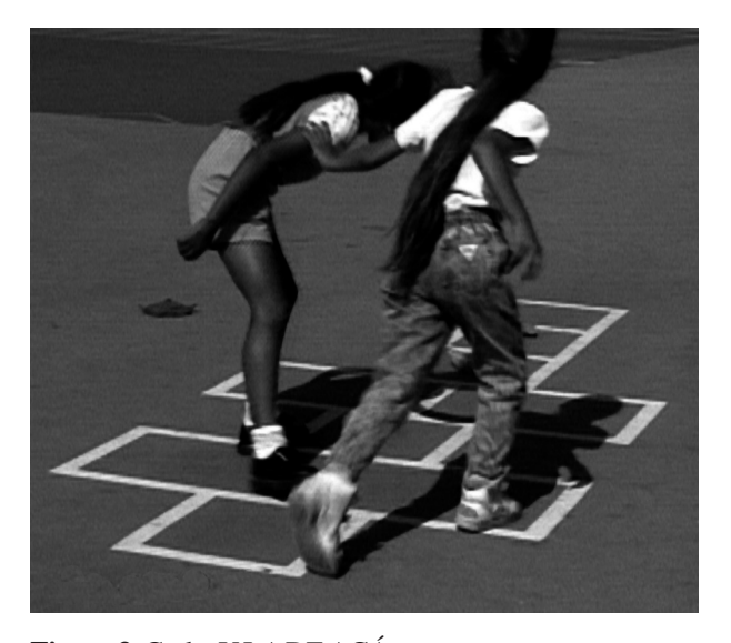
Figure 3. Carla: Y LA DE ACÁ.

fully embodied gestural performance in an inscribed space – could not have been done without the grid, as it provides the relevant background – the necessary tool – for locating violations. Here "this one", the indexical terms in the stream of the speech, the gesture and the grid, as a semiotic field in its own right, mutually elaborate each other (C. Goodwin, 2000).