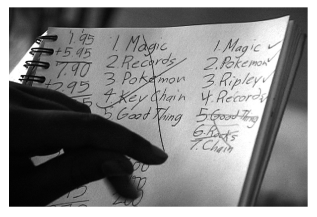
Figure 7. Creating a prioritized list of purchases.