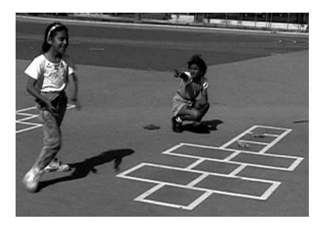
Figure 4. Carla: OUT! OUT!

Carla uses not only verbal means, but also posture and gesture, to accuse another girl, Marisol (at the left of the frame grab), of having landed on a line while making a jump in hopscotch. The way in which an Out is defined by embodied action occurring at a particular location in space provides organization for the body of the judge prior to the call. In order to assess the success or failure of the player's move she positions herself so that she can clearly see the player's feet landing on the grid. By virtue of such positioning Carla's talk is heard as an evaluation of Marisol's performance. A moment before the jump Carla has moved to just such a position. Indeed, the reason she is pointing with her accusing finger from a crouch is that